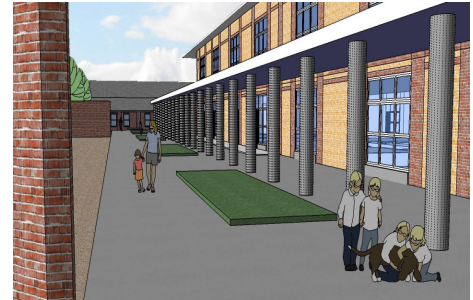
Pre-K through 8th grade school facilitates leadership and mentorship opportunities for all ages.